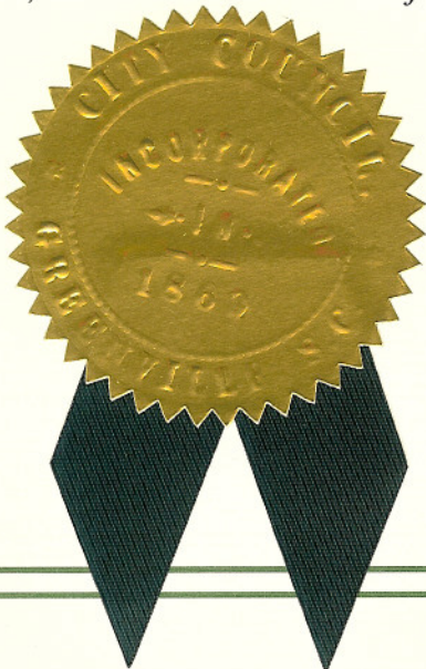
KNOX H. WHITE Mayor

Signed, sealed and delivered this first day of April, 2005.