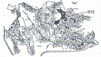
SITE MAP - NOT TO SCALE