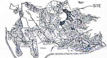
SITE MAP - NOT TO SCALE