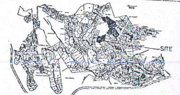
SITE MAP - NOT TO SCALE