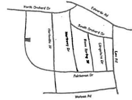
Location Map N.T.S.