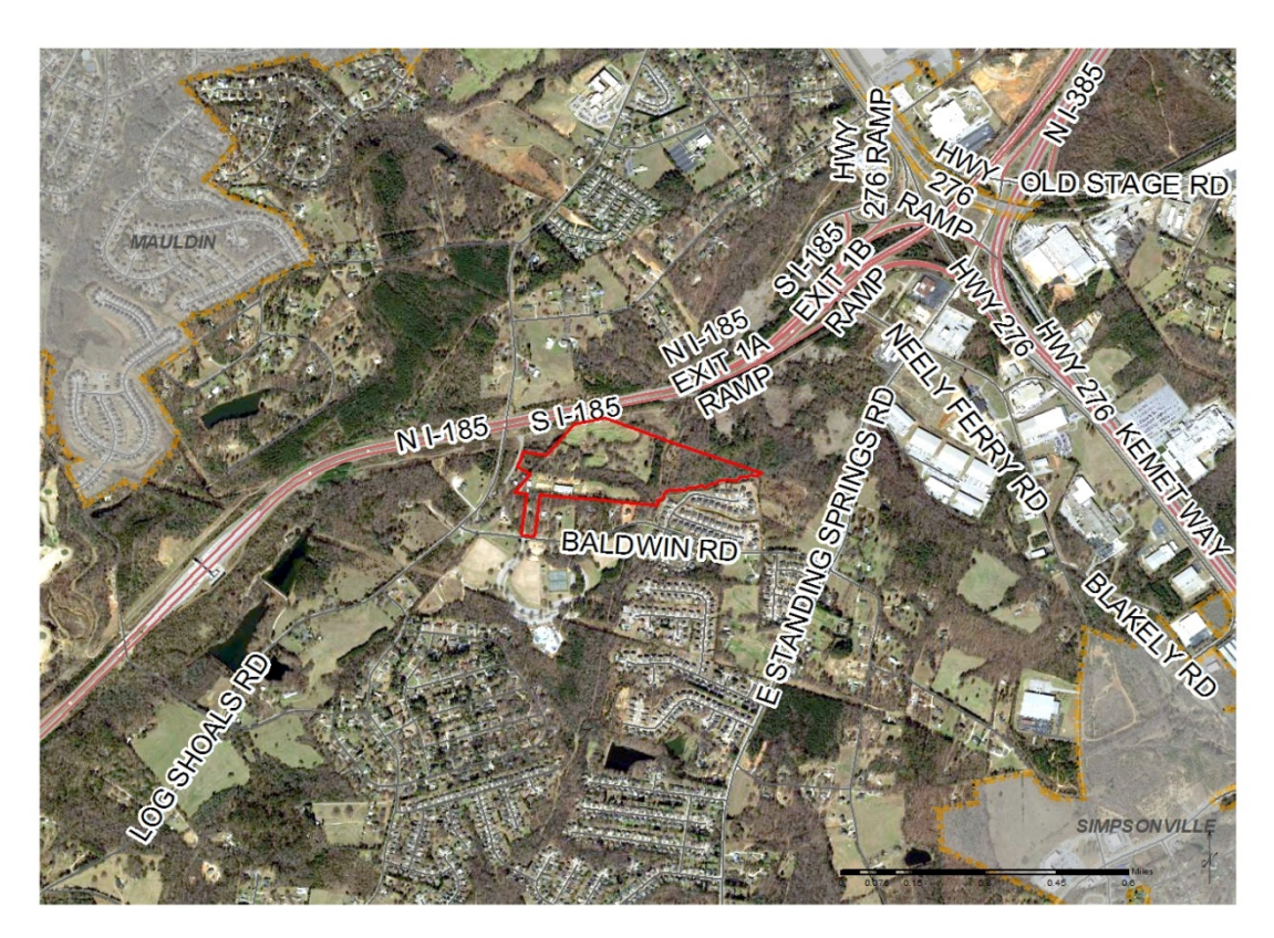
Aerial Photography, 2017