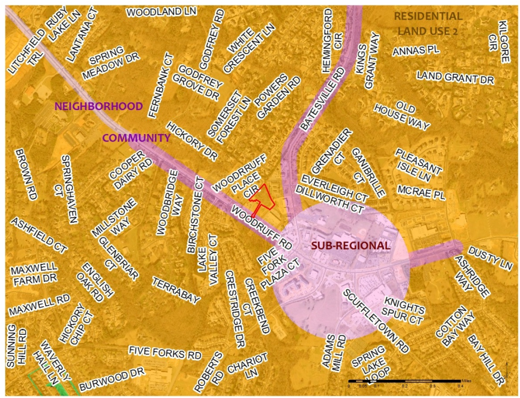
Future Land Use Map