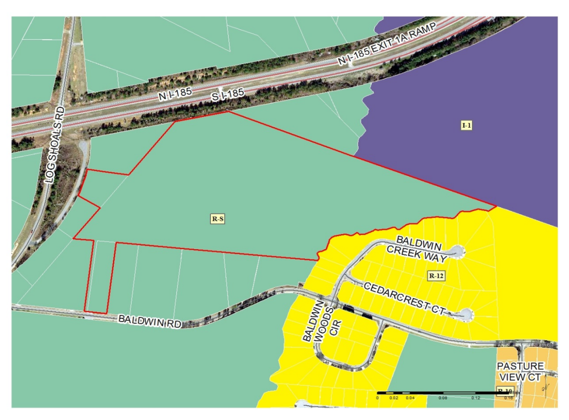
Greenville County Planning Commission Minutes