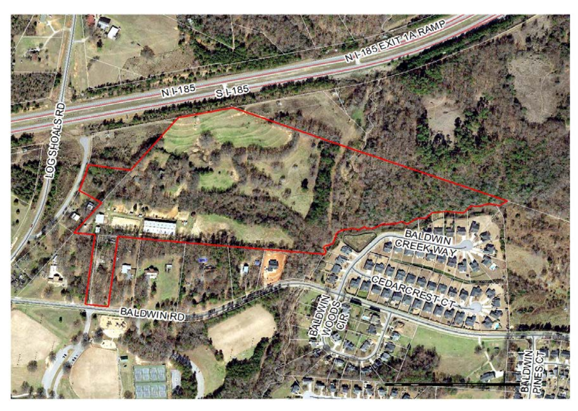
Greenville County Planning Commission Minutes