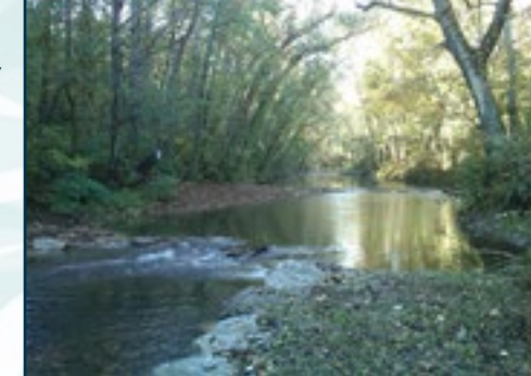
Trout habitat improvement

Soil health continues to be of interest to farmers and one of our small vegetable farmers and a small livestock producer are working with a USC professor on a project to study the impacts of cover crops on soil health.