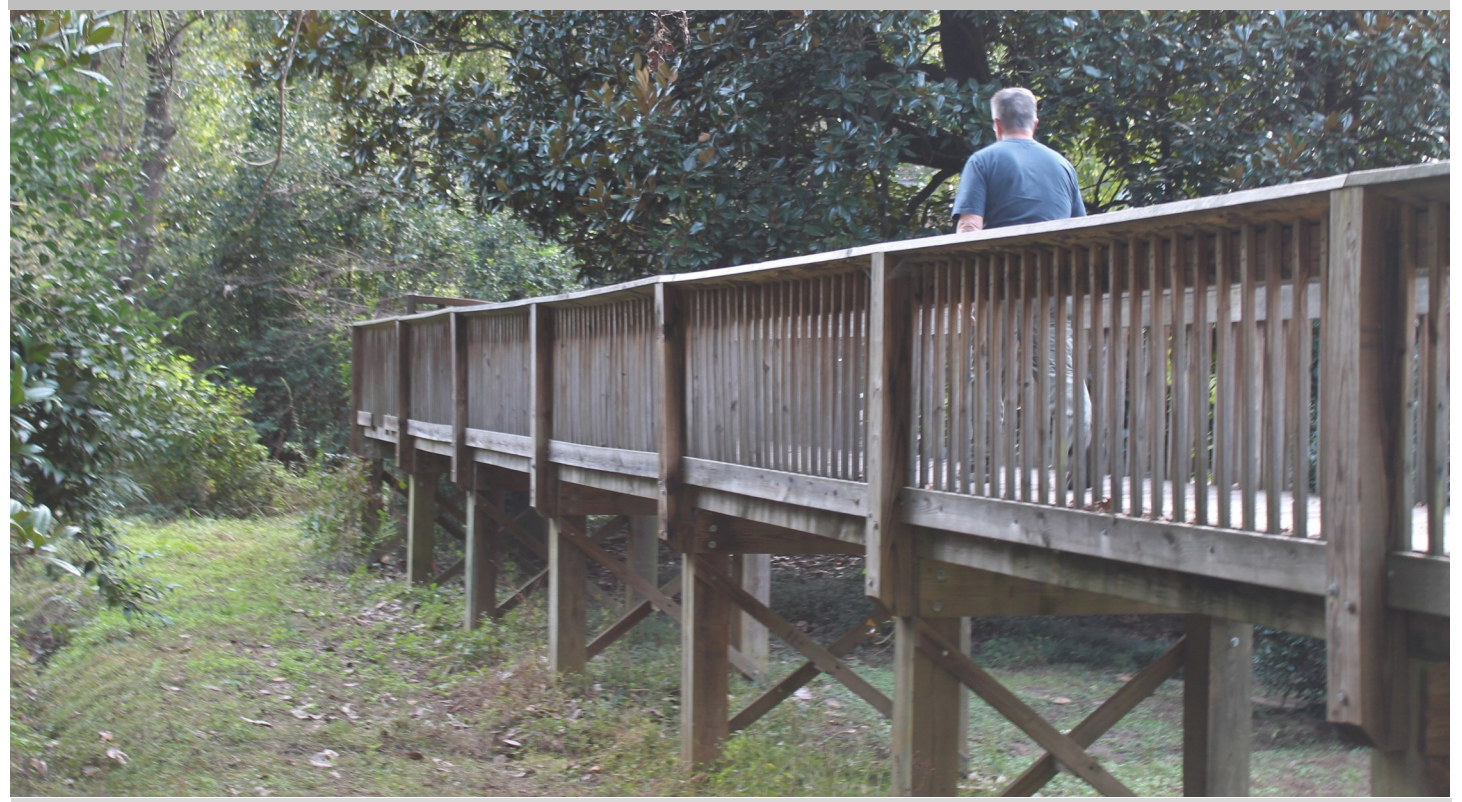
A resident enjoys the natural serenity of land that was cleared following a Greenville County land acquisition.