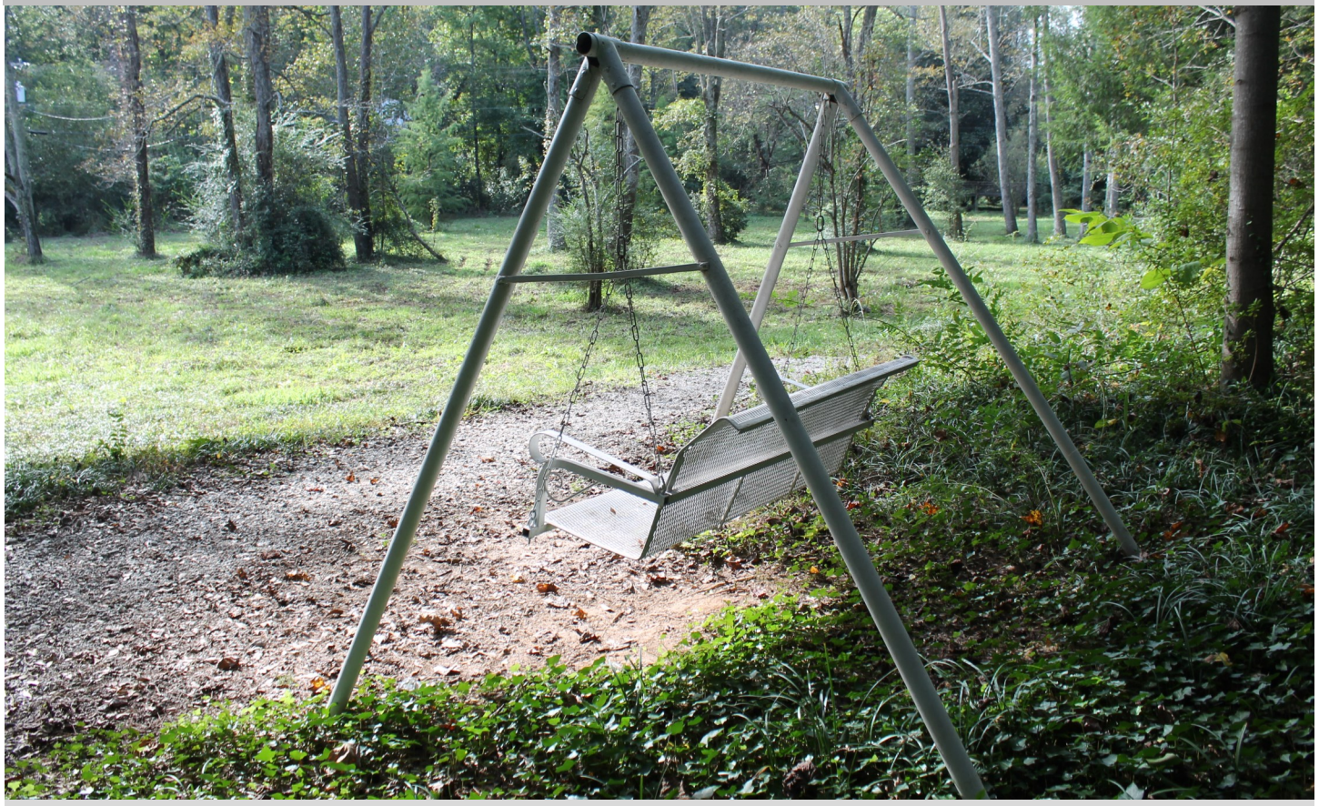
A bench swing awaits visitors in one of the areas cleared by land acquisition

ment of Floodplain Management, Roads and Bridges, Parks and Recreation, Property Maintenance and Facilities. The State, FEMA and the National Park Service also assisted.