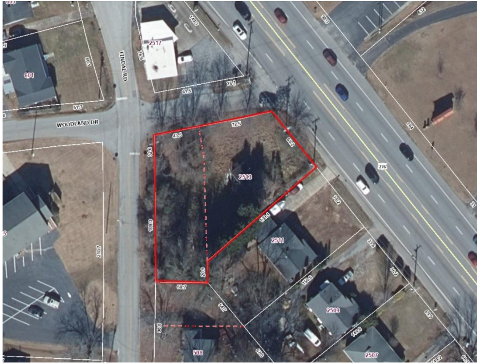
Aerial Photography, 2026