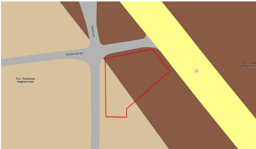
Plan Greenville County, Future Land Use Map