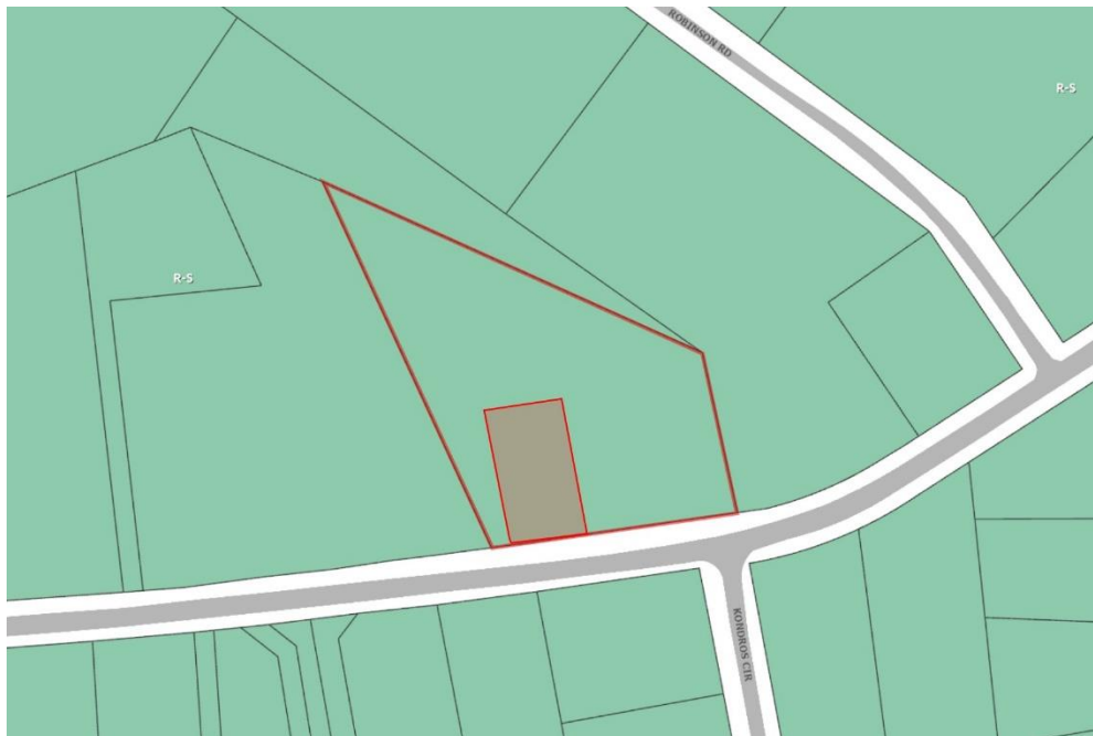
Zoning Map, Zoomed In