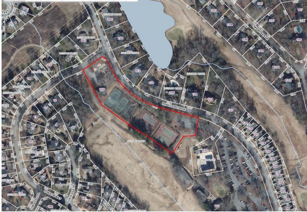
Aerial Photography, 2025