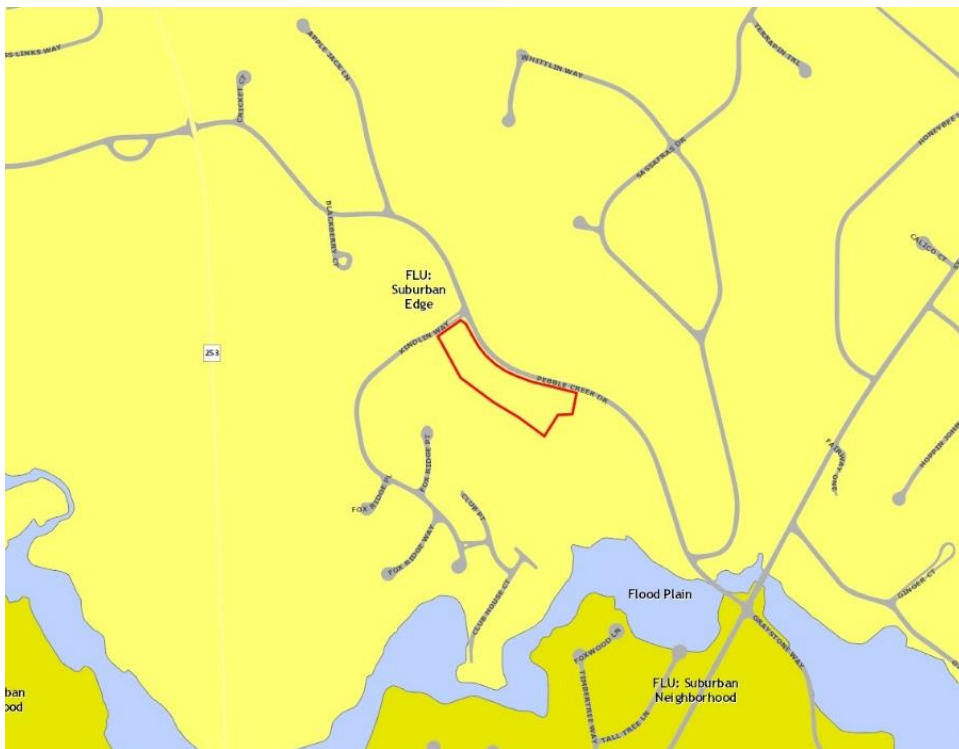
Plan Greenville County, Future Land Use Map