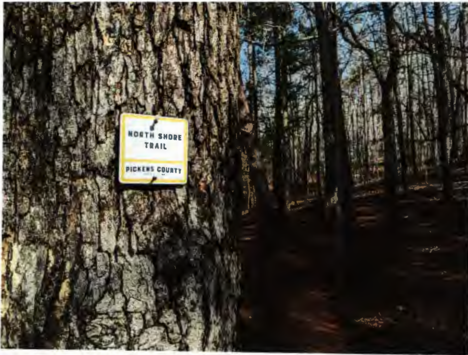
Metal Trail Blazes