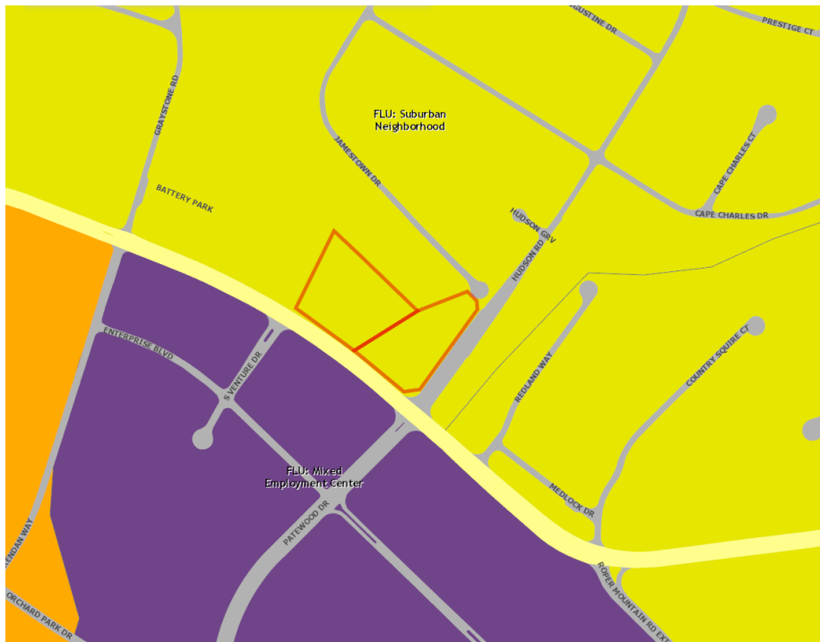
Plan Greenville County, Future Land Use Map