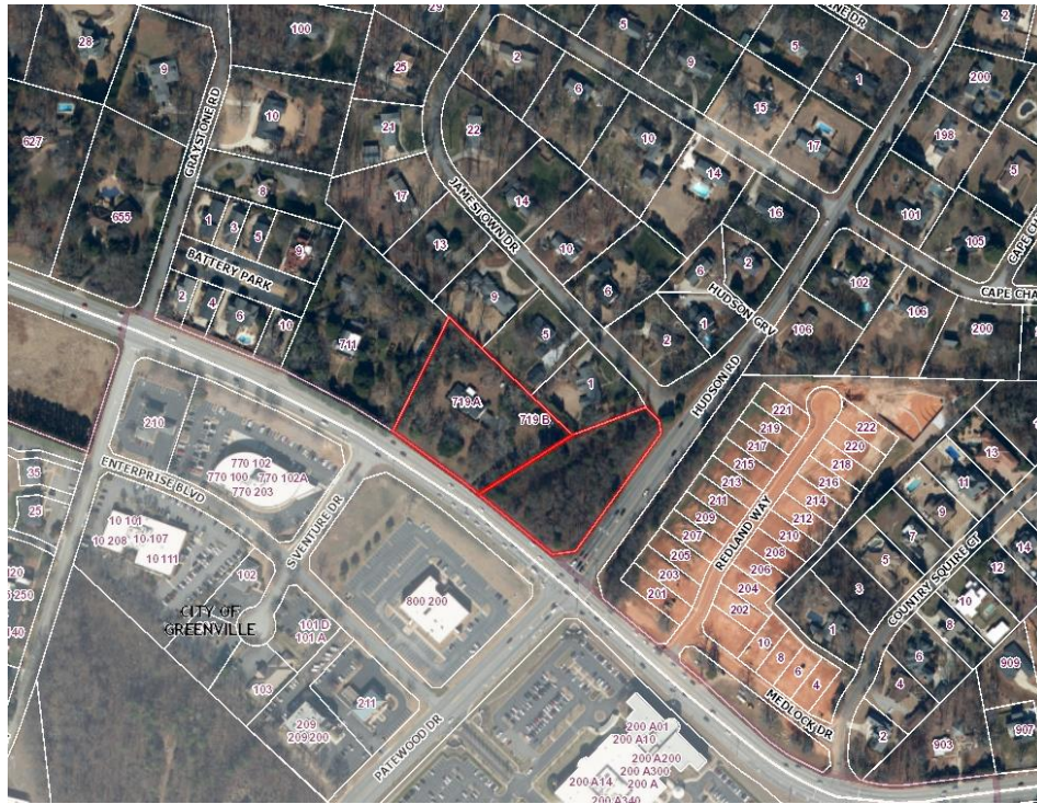
Aerial Photography, 2024