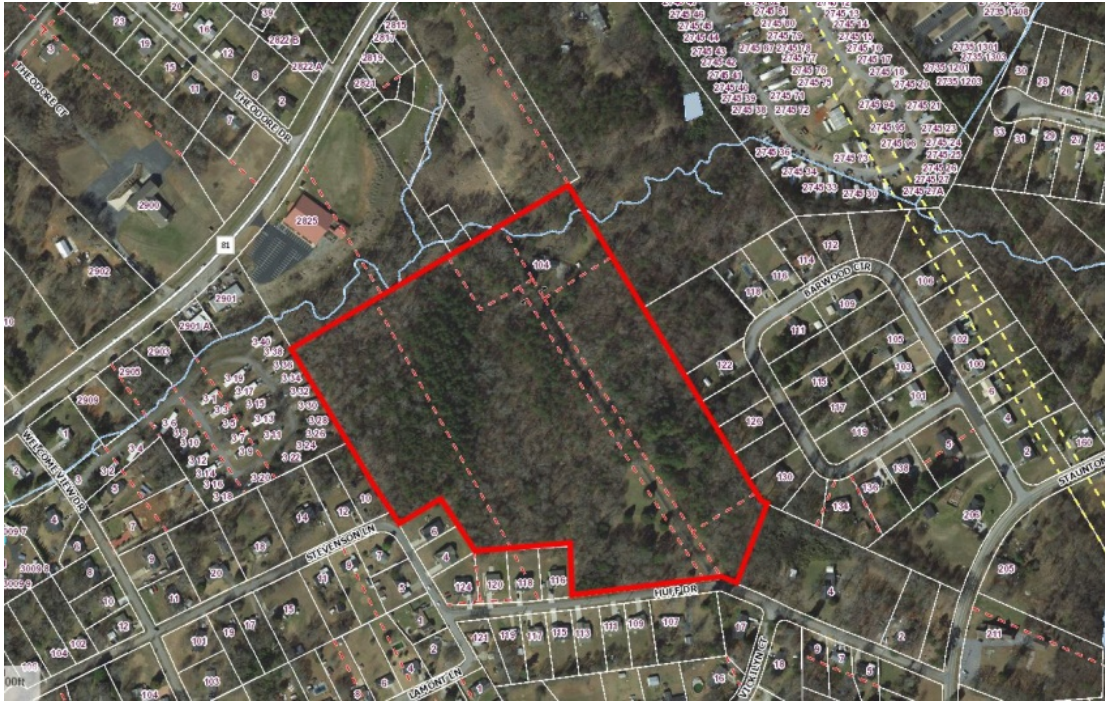
Aerial Photography, 2021