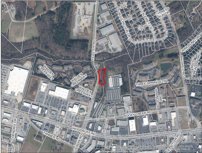
Aerial Photography, 2020

Based on these reasons, staff recommends denial of the requested rezoning to C-2, Commercial.