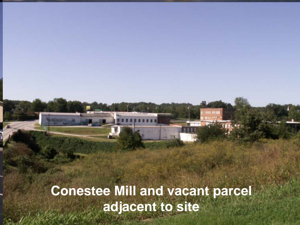
Conestee Mill and vacant parcel adjacent to site