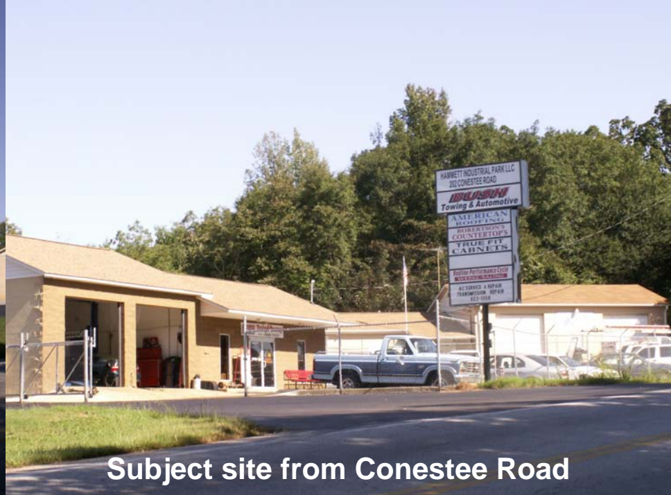
Subject site from Conestee Road