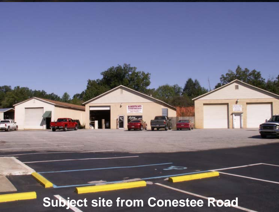
Subject site from Conestee Road