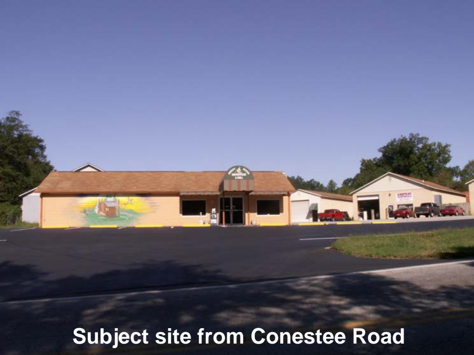
Subject site from Conestee Road