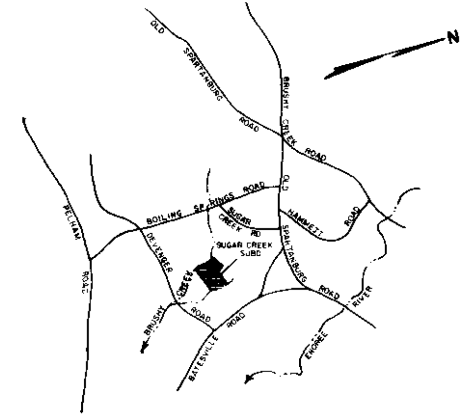
LOCATION MAP N/S