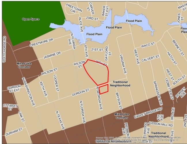
Plan Greenville County, Future Land Use Map