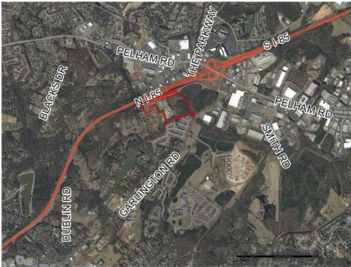
Aerial Photography, 2014; below: floodplain and areas circled with potential increase to flood elevation (source: 2015 Addendum to 2001 Rocky Creek Stormwater Master Plan)