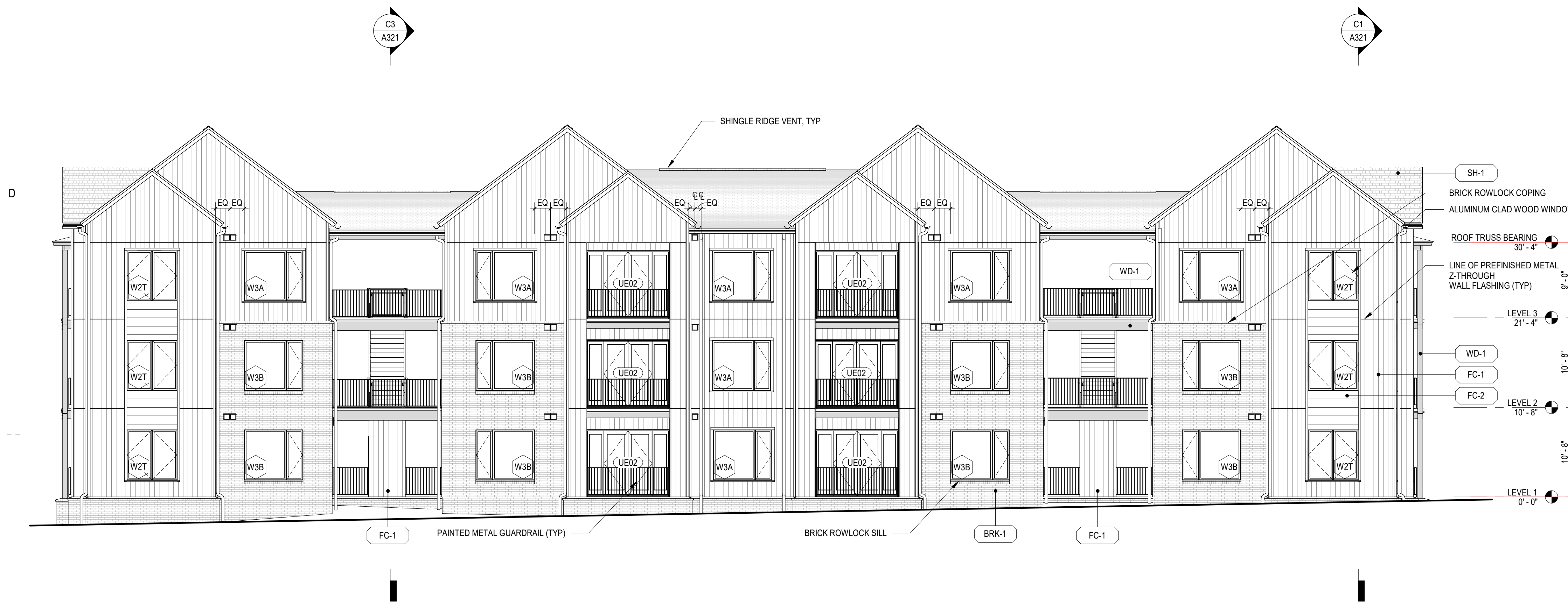
EXTERIOR ELEVATION - BUILDING E NORTH