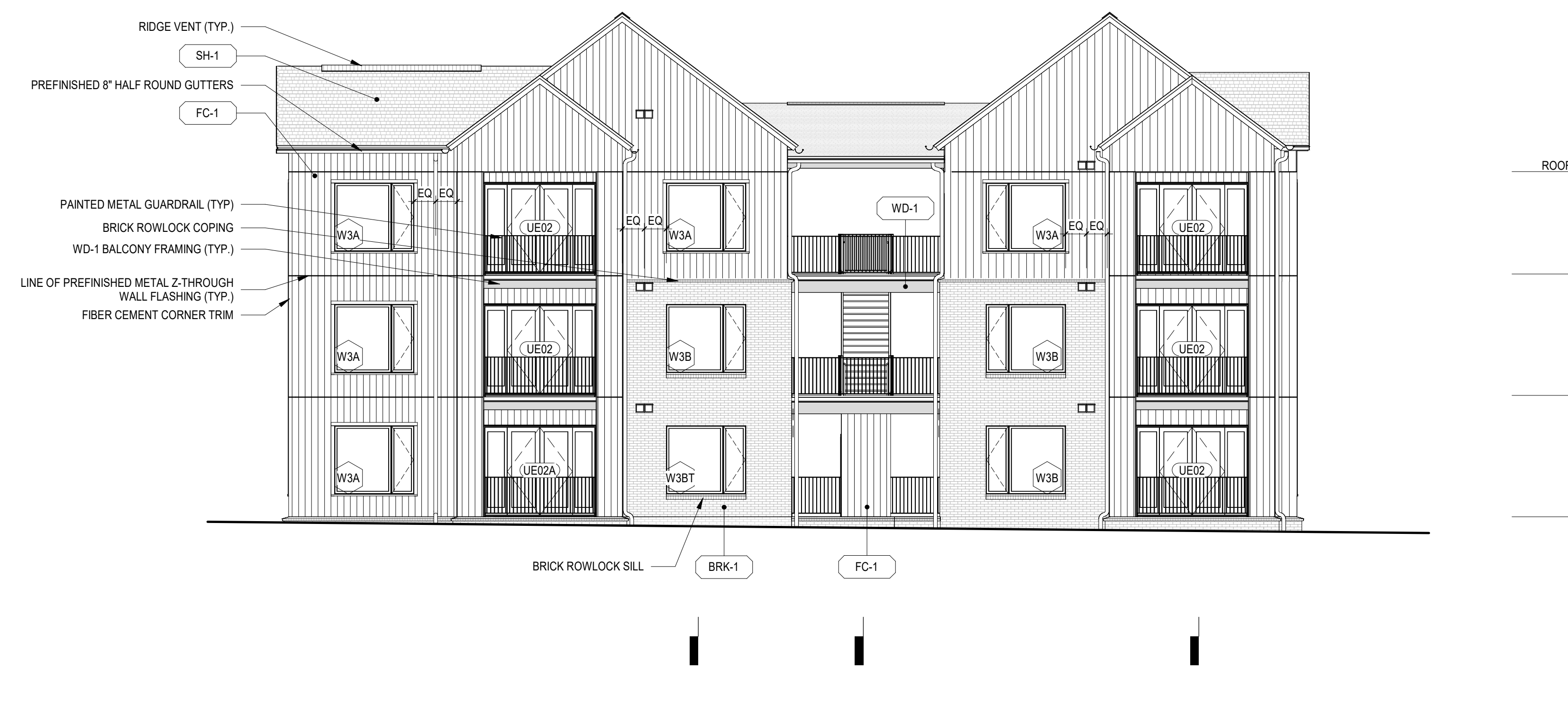
B1 A340 1/8" = 1'-0" EXTERIOR ELEVATION - BUILDING H NORTH