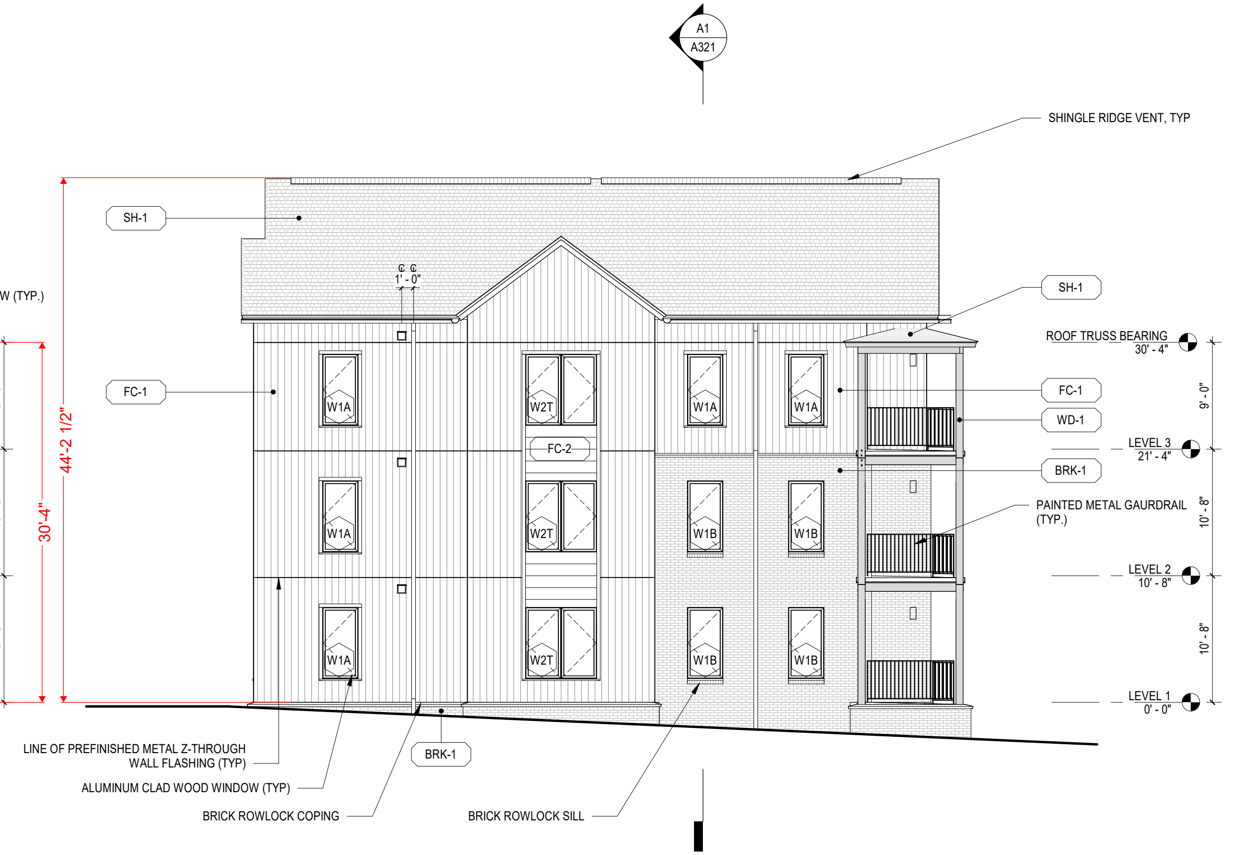
EXTERIOR ELEVATION - BUILDING E WEST