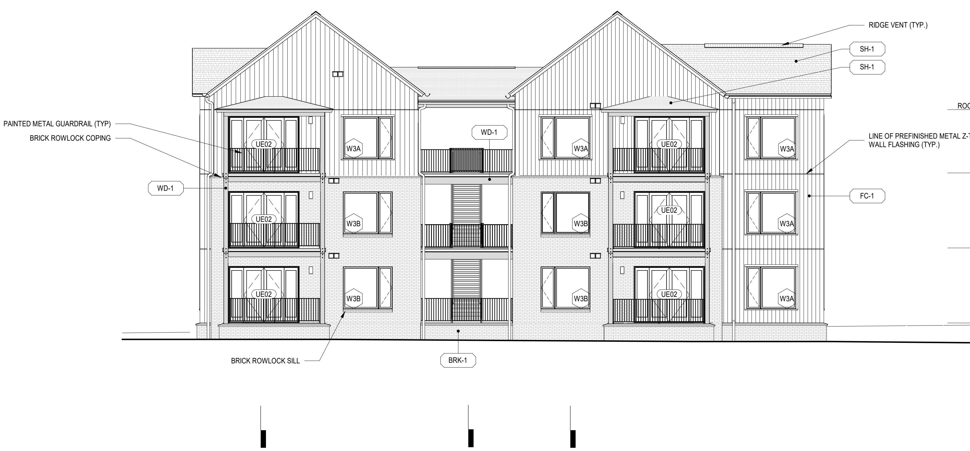
C1 A340 1/8" = 1'-0" EXTERIOR ELEVATION - BUILDING H SOUTH