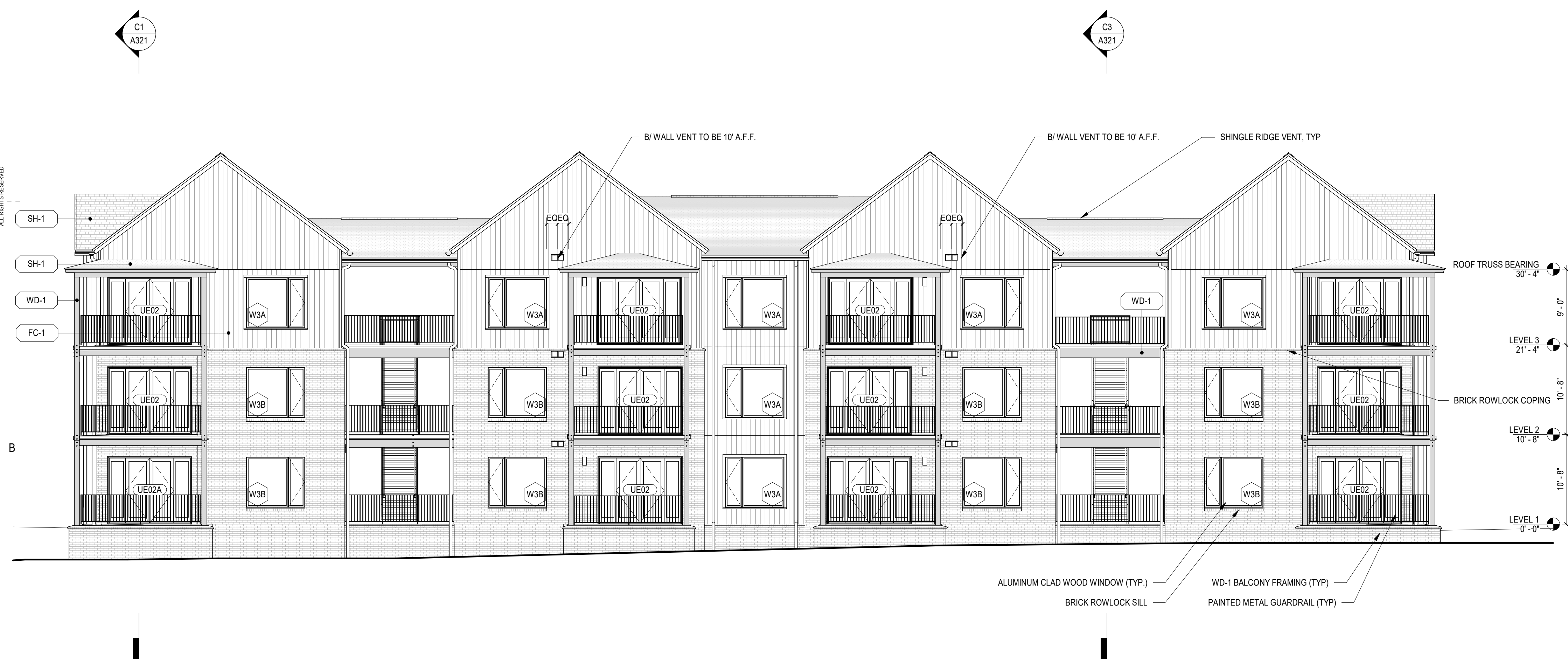
EXTERIOR ELEVATION - BUILDING E SOUTH