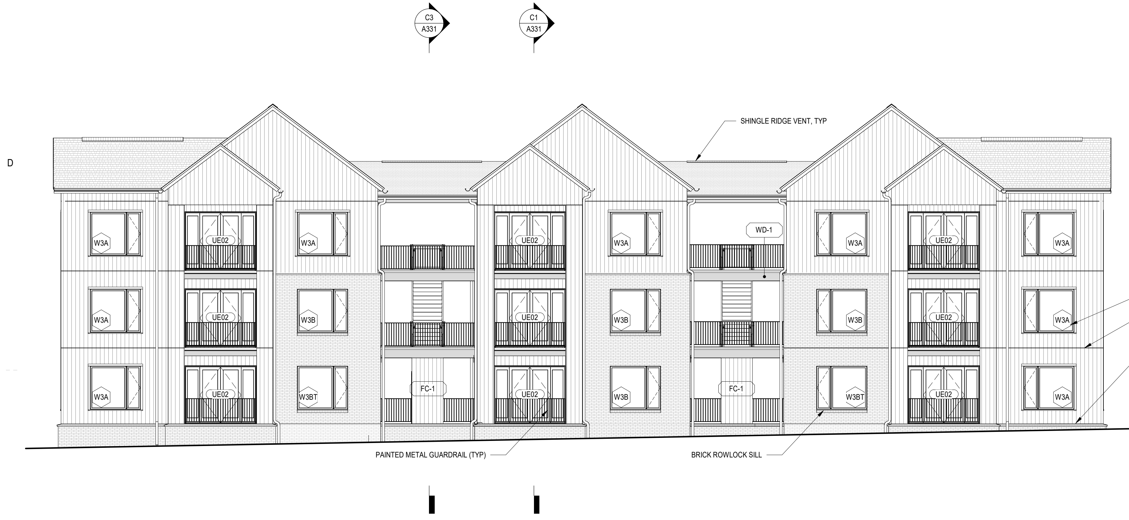
EXTERIOR ELEVATION - BUILDING E NORTH