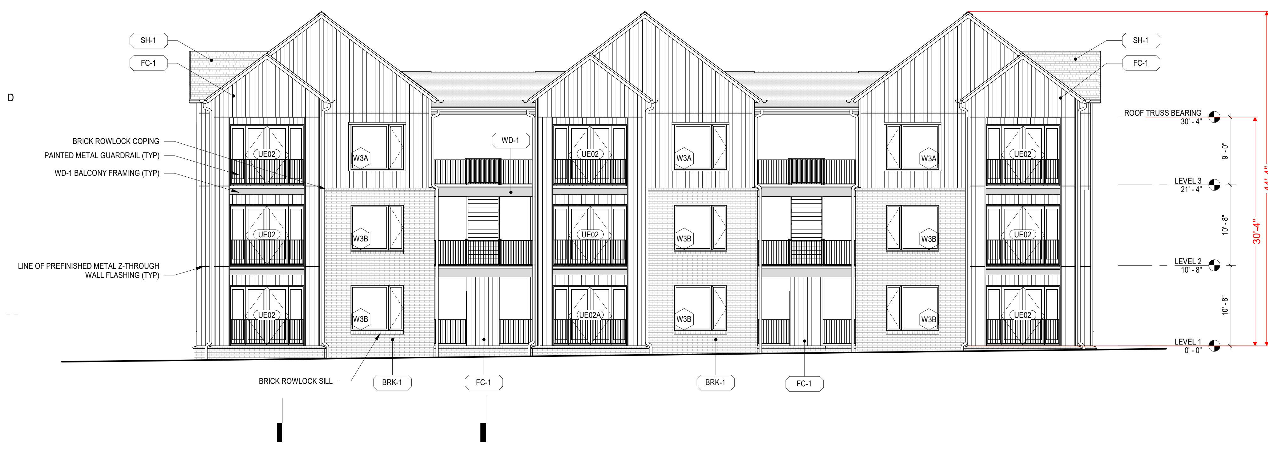
C1 EXTERIOR ELEVATION - BUILDING D NORTH A310 1/8" = 1'-0"