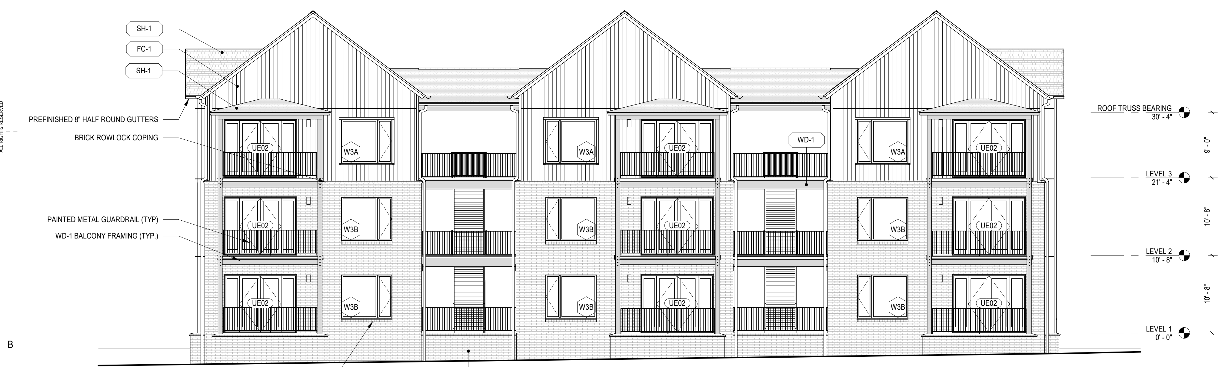
B1 EXTERIOR ELEVATION - BUILDING D SOUTH A310 1/8" = 1'-0"