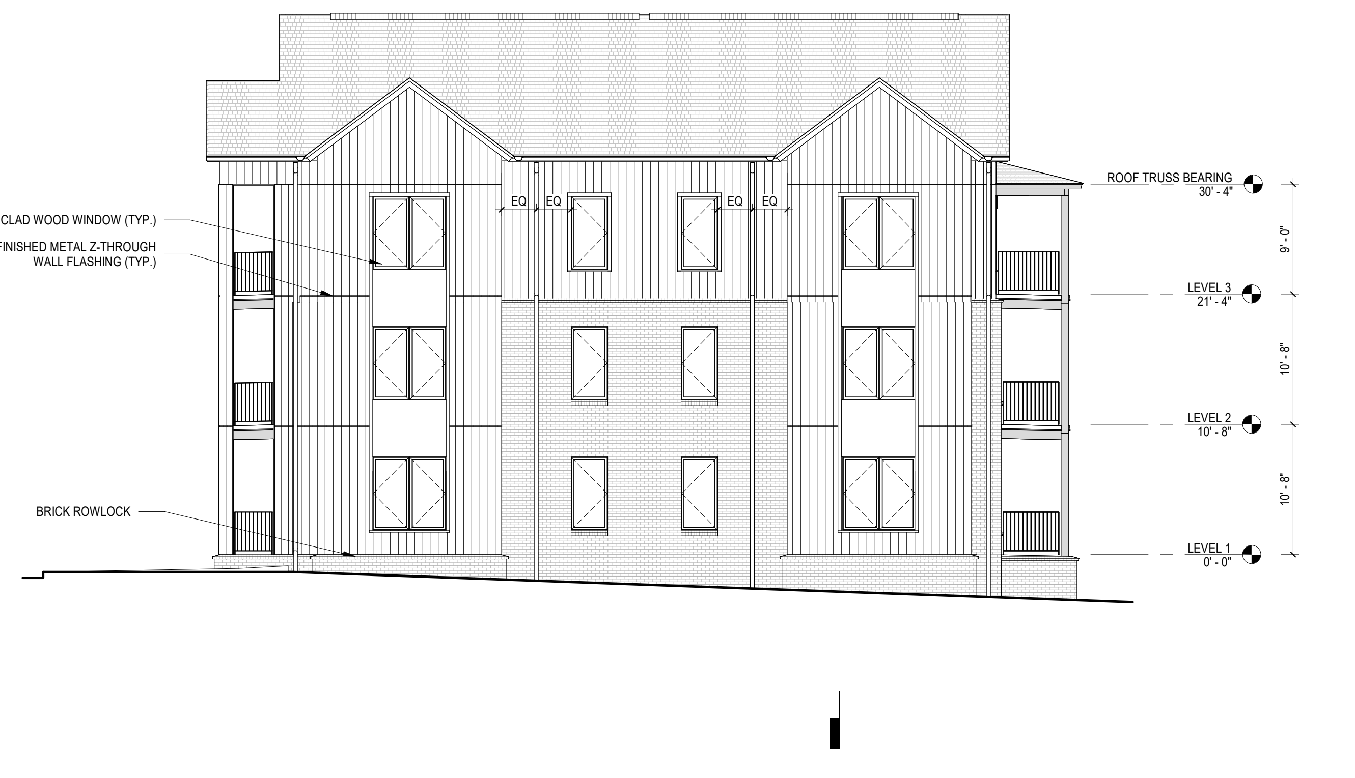
B3 A340 1/8" = 1'-0" EXTERIOR ELEVATION - BUILDING H WEST