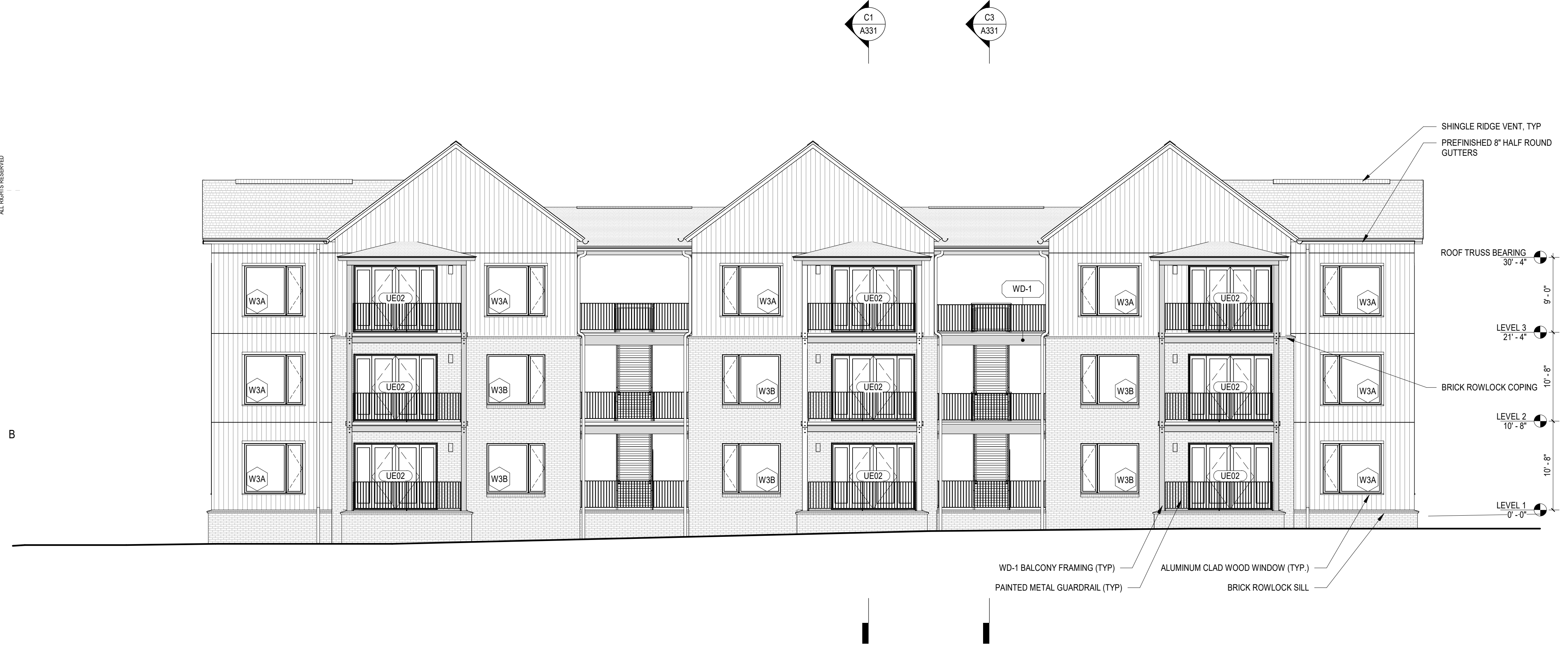
EXTERIOR ELEVATION - BUILDING E SOUTH