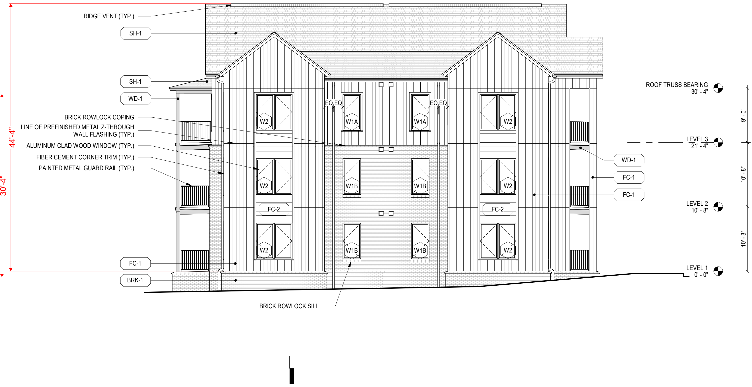
C3 A340 1/8" = 1'-0" EXTERIOR ELEVATION - BUILDING H EAST