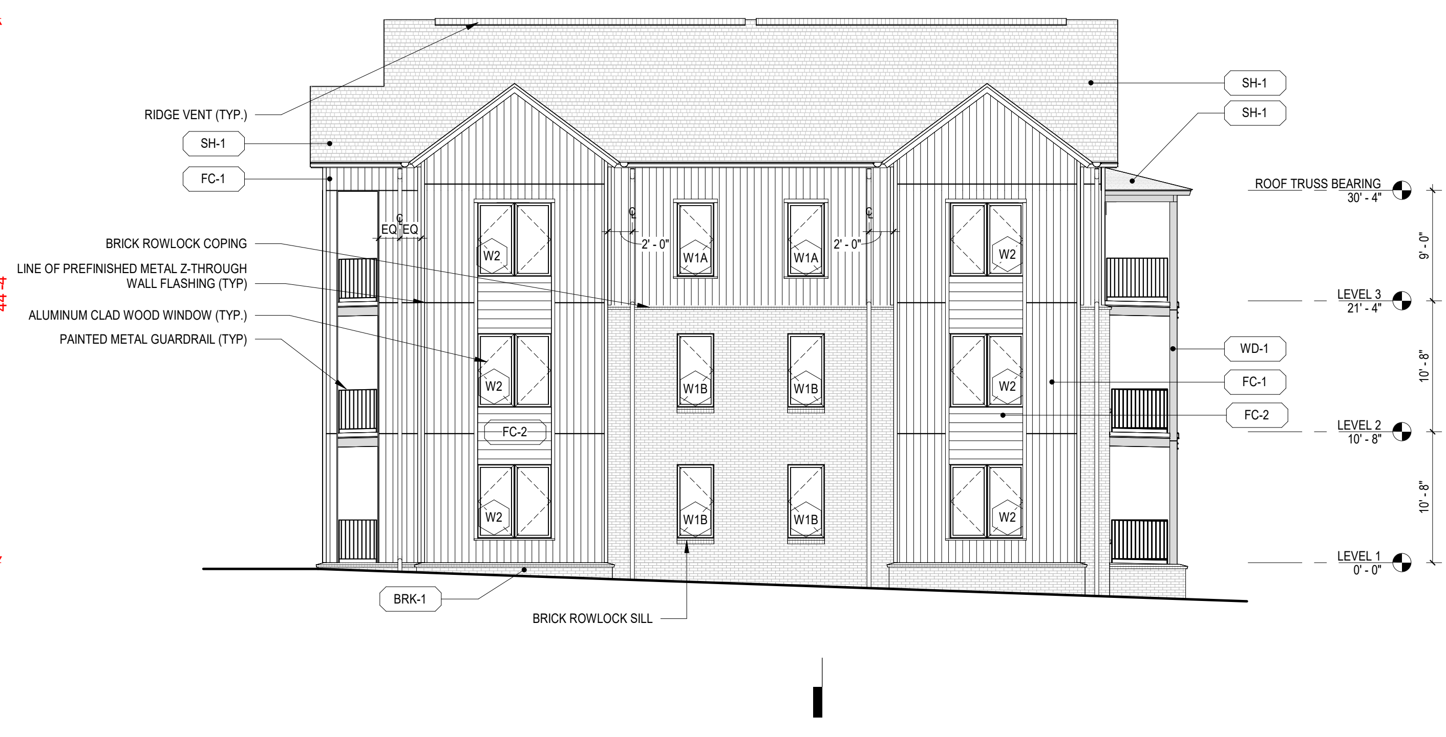
C3 EXTERIOR ELEVATION - BUILDING D WEST A310 1/8" = 1'-0"