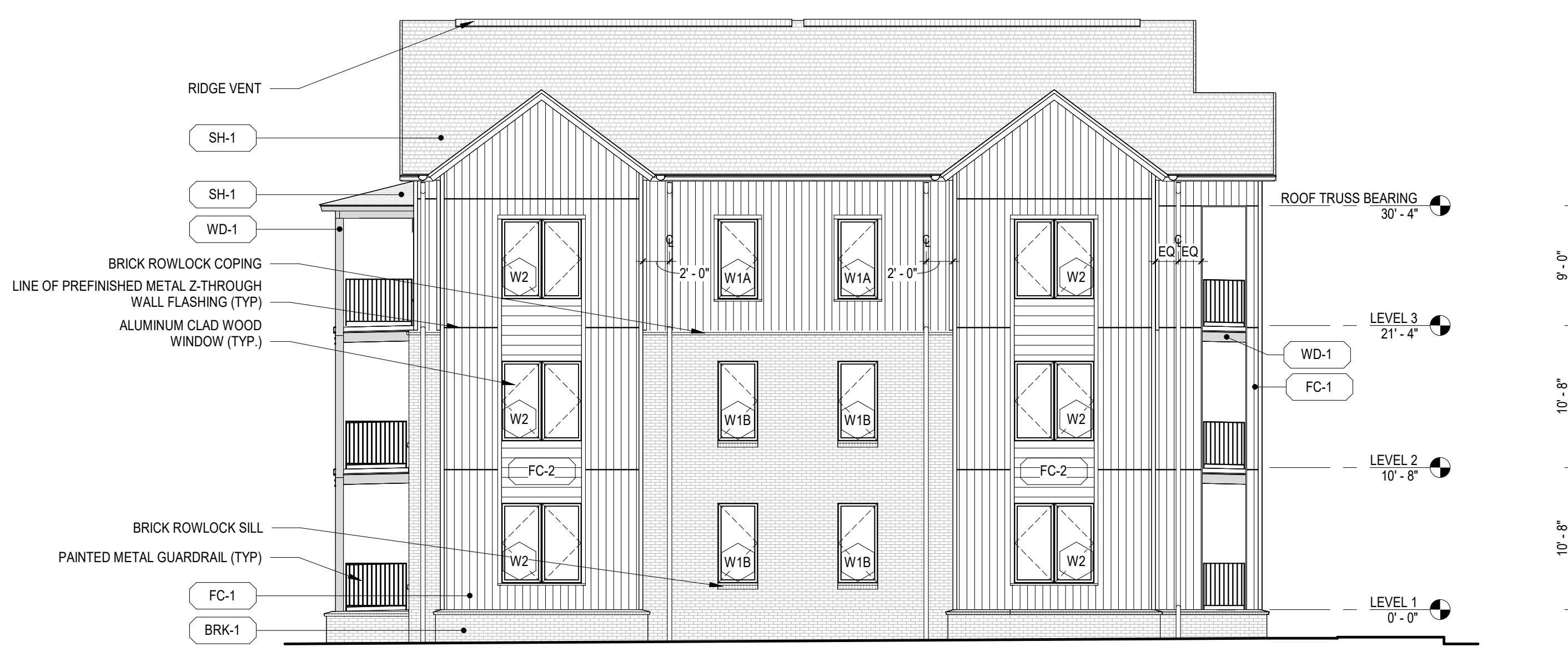
B3 EXTERIOR ELEVATION - BUILDING D EAST A310 1/8" = 1'-0"