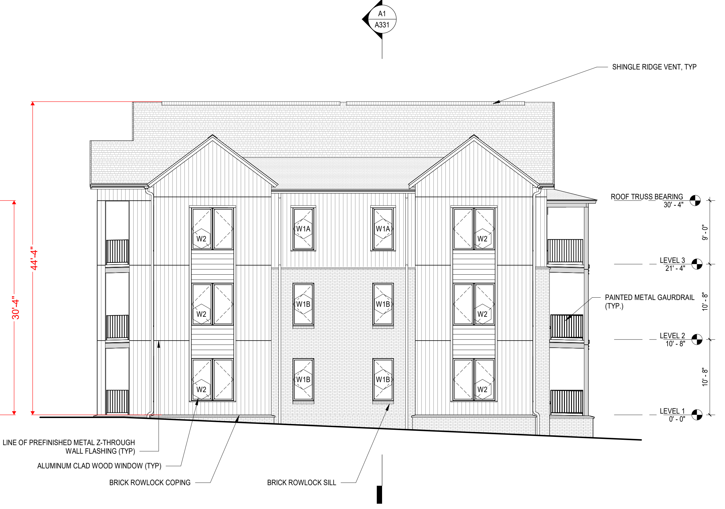
EXTERIOR ELEVATION - BUILDING E WEST