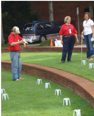
Program staff performing a catch cup test