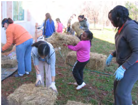
More than 50 volunteers and staff worked to amend the poor soil before planting