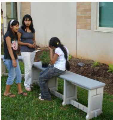
Students in the afterschool "Garden Club" care for the gardens and spend time together in the seating area