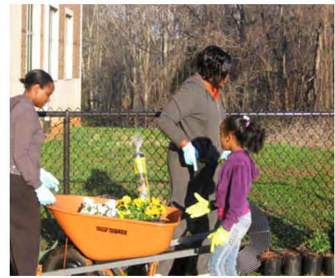
Volunteers of all ages pitched in to install gardens, signs, native ferns, and a native rock area