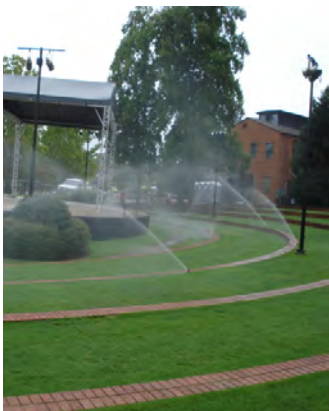
Irrigation systems behind the Peace Center were checked as part of the program