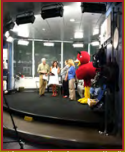
"Conservation Conversation" Segment on Your Carolina