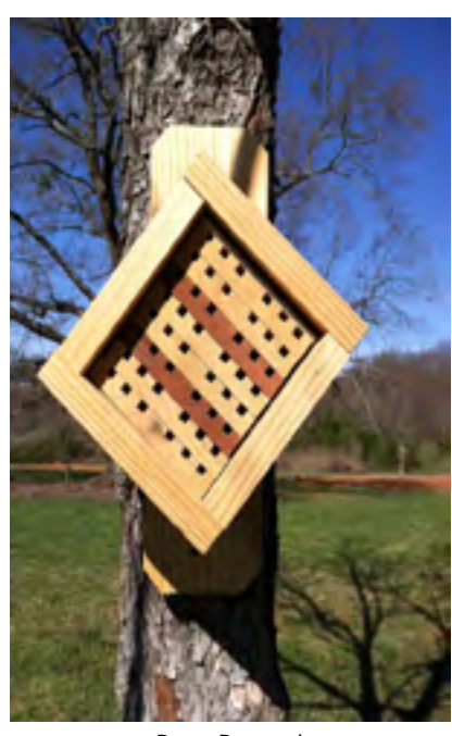
Bee Box at Lake Conestee Nature Park