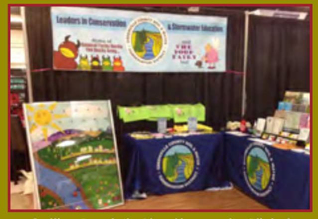
Getting Ready to Play Stormwater Plinko!