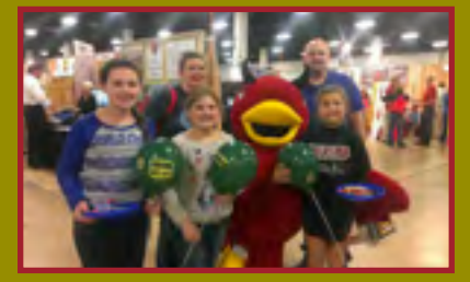
General Yucky Ducky & Fans