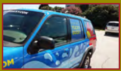
District Vehicle All Dressed Up