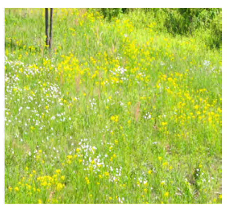
Pollinator Meadows improve habitat for bees and other insects and birds beneficial to our crops

These practices and many more are eligible for cost share funding through the NRCS Environmental Quality Incentive program.