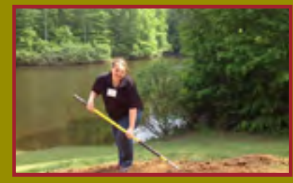
Certified Rain Garden Professionals!