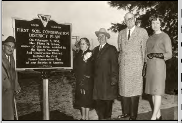
Dedication of the Farm Plan under the First Soil Conservation District Plan in the U.S. 1938, Spartanburg, SC

NRCS staff continues to work with many local farmers and landowners throughout Greenville County to decrease soil erosion, improve water quality and restore wildlife habitat. NRCS provides technical as well as cost share assistance. This past year, Greenville County citizens received $114,715 in cost share funds through the Environmental Quality Incentive Program to assist farmers in the installation of watering tanks, heavy use areas, fencing, water bars,