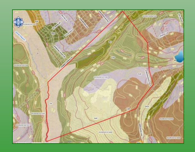
Overhead view of Riverside Middle School outlining available space for proposed Outdoor Learning Center and Nature Trail.