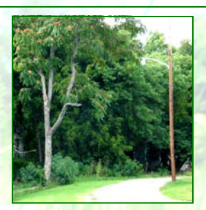
Project plans include a native rock seating area near walking trails

What was once a drug-infested city block of crack houses in downtown Greenville is being transformed into a beautiful park for children and adults to enjoy. Through a partnership among Long Branch church, the Natural Resources Conservation Service (NRCS), Greenville County Soil & Water Conservation District (SWCD), and Foothills Resource Conservation and Development Council (RC & D), a community is benefiting from urban conservation.